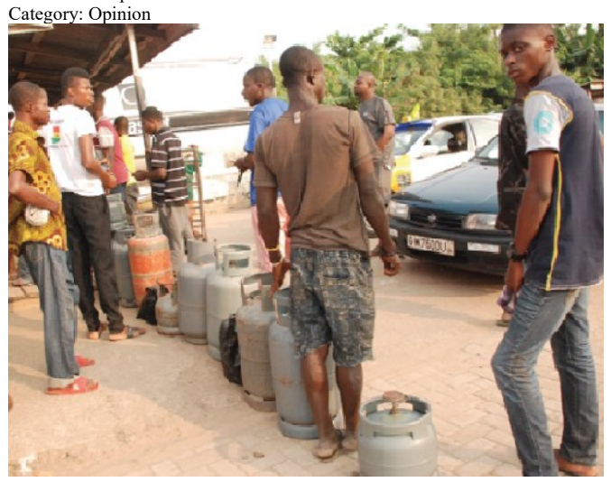
Customers buying LPG at a gas filing station

Date: Jan 18 , 2017 , 01:06 BY: Isaac Simpson